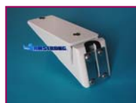
RM-S Retro-fit Mount Slotted