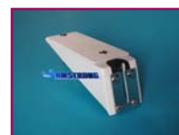
RM-NS Retro-fit Mount Non-Slotted