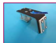
PLM Platform Ladder Mount