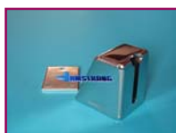
TLM-S Transom Mount