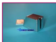
TLM-SXL Transom Mount