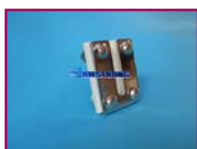
LFP Ladder Mount with SB.5